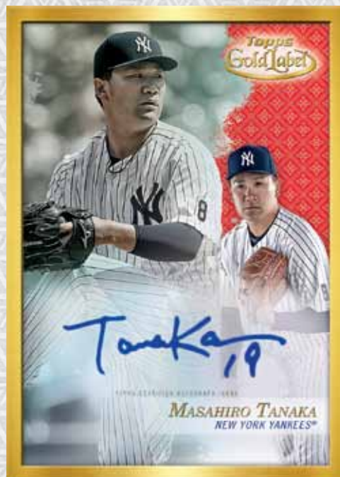
Framed Autograph Card - Red Parallel

MAKE YOUR PURCHASE FOR 2017 TOPPS GOLD LABEL TODAY PRODUCT AVAILABLE IN SEPTEMBER 2017