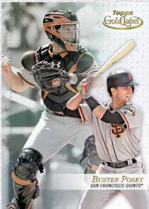
Class 1 Card

Class 1 – 1/1 Class 2 – 1/1 Class 3 – 1/1