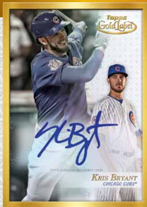
Framed Autograph Card