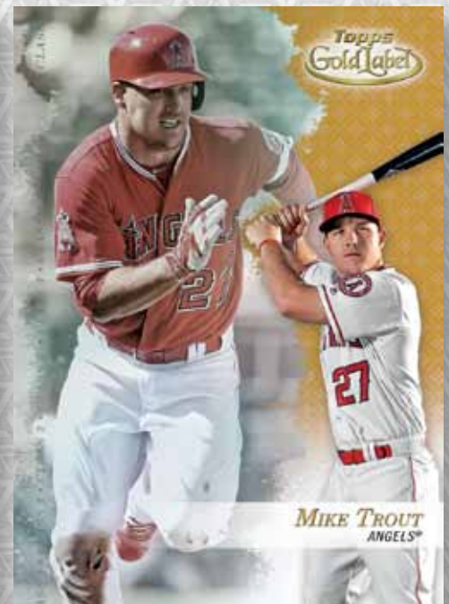
Class 3 Card - Gold Parallel