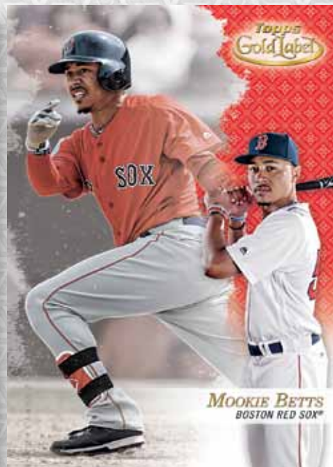
Class 2 Card - Red Parallel